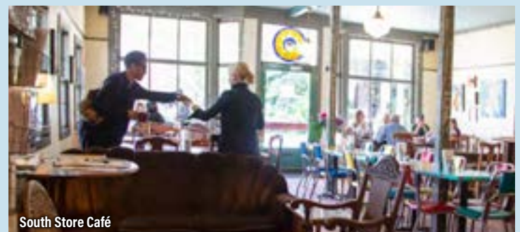
South Store Café

Opening days and hours subject to change without notice.