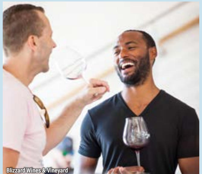
Blizzard Wines & Vineyard